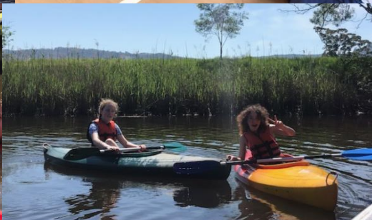
Year 6 Berry Sport and Recreation Camp