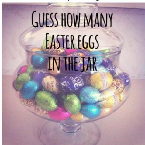
(The picture is not the actual jar)